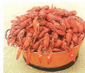
3 Baton Rouge, La. (14) $18.8 million