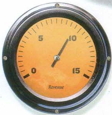
Median revenue ($9.9 million)