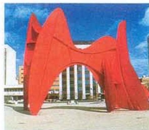
1 Grand Rapids, Mich. (16 companies) $26.2 million