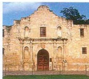
2 San Antonio (25) $21.3 million