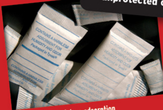
Desiccants for moisture adsorption