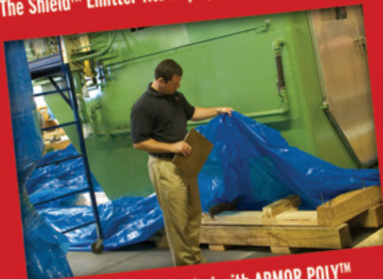
Large equipment protected with ARMOR POLY™