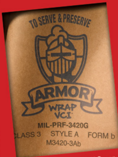
U.S. Military approved VCI Paper